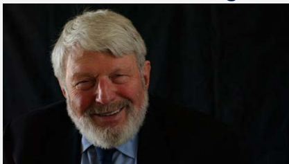
Legendary actor and folk singer, Theodore Bikel , passed away Tuesday at the age of 91.