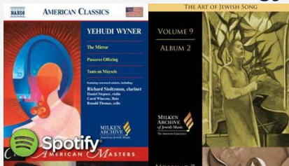
Grasp the scope of Yehudi Wyner: Jewish Works and Beyond now in our Spotify playlist.