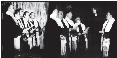
A traditional male-voice synagogue choir.

weekday (and is not during a mourning period), the typical presentation is nonetheless a cappella. Nearly all composed selections for First S'lihot services are taken from the repertoire of Yom Kippur, when, as on all holy days, such instrumental use is prohibited by traditional interpretations of halakha (Jewish law). These particular settings, and alternative ones in similar styles, were therefore composed according to that prerequisite. The a cappella timbre—including idiomatic choral imitations of instrumental figures and effects—is a fundamental part of the aesthetic identity of this music.