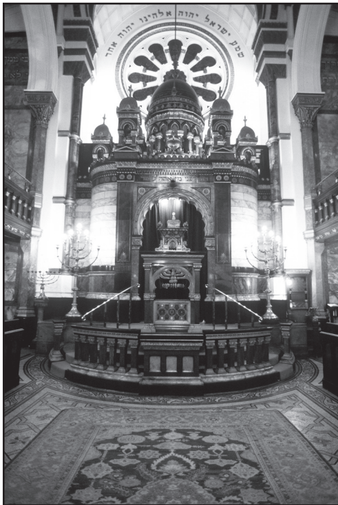
The New West End Synagogue in St. Petersburg Place, Bayswater, one of London's oldest orthodox Ashkenazi synagogues and the recording venue for the Milken Archive s'lilot service. Constructed in 1877, this beautiful house of prayer was consecrated in 1879.