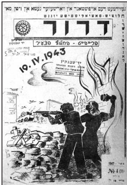
D'ror No. 4 (11), cover, May 1947 issue, published in Łódź, dedicated to the resistance fighters of the Warsaw Ghetto Uprising

annihilation. As 1942 drew to a close, the ZOB, joined by the Bund, scrambled to intensify preparations for armed resistance. Some weapons were smuggled into the ghetto with the aid of Polish underground organizations on the outside; other arms were acquired on the black market. Homemade firearms were also manufactured in secret underground workshops, and bunkers and tunnels were created.