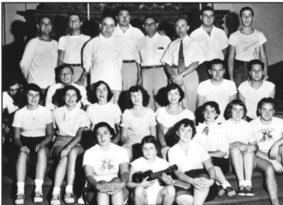
Arts Institute students and faculty.