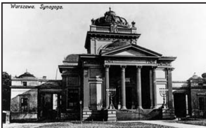
The Tlomackie Synagogue in Warsaw, prior to 1943

had commanded the so-named “Great Operation” ( Grossaktion ) since April 19, reported the successful and complete liquidation of the ghetto. To mark his victory, the grand synagogue on Tlomackie Street was blown up and leveled. This, one of Europe’s most famous and most elaborate synagogues, its pulpit home to some of the greatest cantors of the century, was a symbol of Warsaw Jewry’s former prosperity and cultural sophistication. (After the war, an office building constructed on the site was plagued with insoluble structural and technical problems; a rumor persisted in Warsaw that the “ghosts” of the ghetto had indelibly sabotaged the new building.)