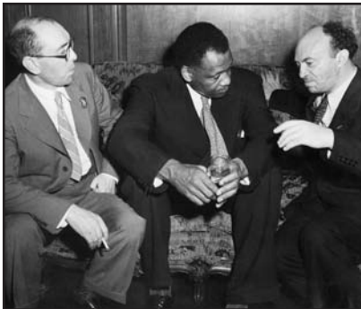
Fefer, Robeson, and Mikhoels at the Soviet Consulate, New York City, summer 1943

anti-Semites, pro-Fascists, and isolationist antiwar factions who might welcome “proof” that the American war effort in the European theater was indeed the result of Jewish and “international Zionist” instigation on behalf of European Jewry.