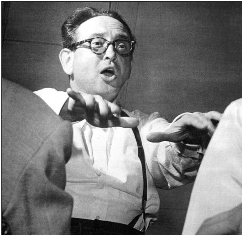
"Max was a Pied Piper; a Svengali—a shaper of men." —Jack Gottlieb