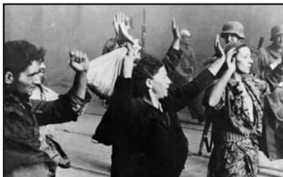
Members of the Jewish resistance captured by SS troops during the suppression of the Warsaw Ghetto Uprising

the new Polish People’s Republic, where he was also wanted as a war criminal. He was tried in 1951 in the Warsaw district court, and hanged on the site of the former ghetto that same year.