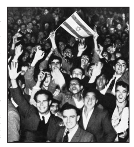
November 29, 1947. Jews in Tel Aviv celebrate the United Nations vote for the partition of Palestine.

Hatikva also was sung unofficially as the de facto anthem of Jewish Palestine under the British Mandate—from the end of the First World War until 1947. Moreover, for many Jews in the Diaspora who were not necessarily committed members of Zionist organizations or active in Zionist circles but were