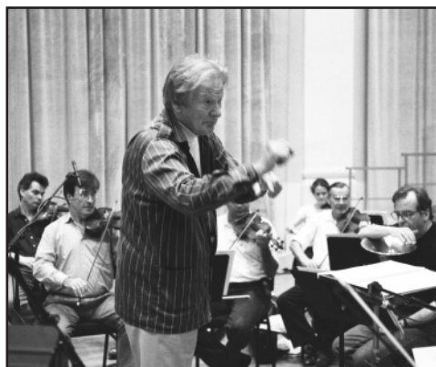
Sir Neville Marriner rehearsing with the orchestra