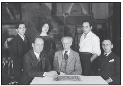
Members of the cast of The Golem with H. Leivick (center) and Joseph Achron (right), New York, 1931.

In the ensuing centuries, the various golem legends solidified as the image of a creature whose animation usually depended upon the "holy" letters in physical contact with